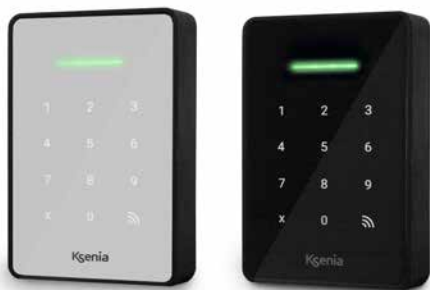
KS12100031.302 - ergo-X black KS12100031.303 - ergo-X grey